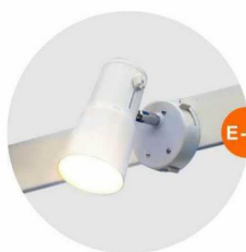
E-01 射燈 (白色) Spotlight (White) 23W

Reference photos for additional electricity installation (partial)