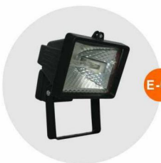
E-05 泛光燈(小太陽) Halogen floodlight 500W