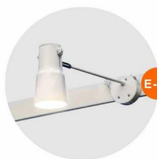
E-02 長臂射燈 (白色) Long-arm Spotlight (White) 23W