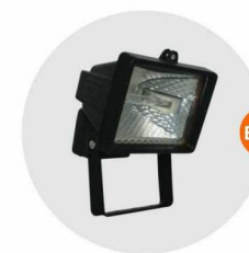
E-04 泛光燈(小太陽) Halogen floodlight 300W