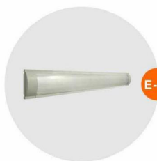
E-03 光管 Fluorescent Tube 28W