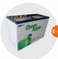
E-11 座地冷凍冰箱 (-18度)(不包括電插座) Sitting Style Refrigerator (-18°C, Excluding Socket) 1.2'