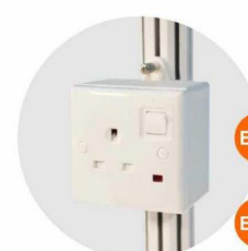
E-12 插座(不能用於照明用電) Single Phase Socket (for machine only) 1000W(220V)